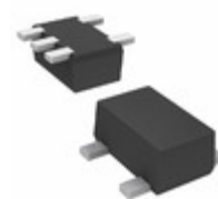
DMG563010R Panasonic Electronic Components TRANS PREBIAS NPN/PNP SMINI5