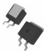
DSEI19-06AS IXYS DIODE GEN PURP 600V 20A TO263AA