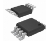
MIC5236-3.3YMM-TR Micrel / Microchip Technology IC REG LDO 3.3V 0.15A 8MSOP