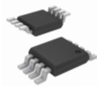
MIC5236-3.3YMM Micrel / Microchip Technology IC REG LDO 3.3V 0.15A 8MSOP