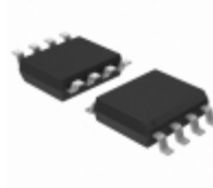
MIC5236-3.3YM-TR Micrel / Microchip Technology IC REG LDO 3.3V 0.15A 8SOIC