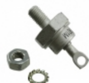
DSI75-12B IXYS DIODE GEN PURP 1.2KV 110A DO203