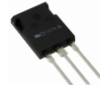
DSI45-16AR IXYS DIODE GEN 1.6KV 48A ISOPLUS247