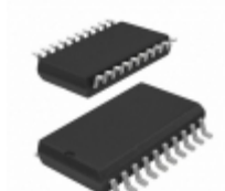
SY100EL91LZC-TR Micrel / Microchip Technology IC TRANSLATOR TRIPLE 20-SOIC