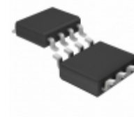
LT1217CS8#TRPBF Linear Technology / Analog Devices IC OPAMP CFA 10MHZ 8SO