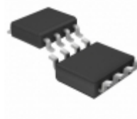
LT1217CS8#PBF Linear Technology / Analog Devices IC OPAMP CFA 10MHZ 8SO