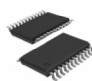
ADM3312EARUZ ADI (Analog Devices, Inc.) IC TXRX RS-232 3:3 2.7V 24-TSSOP