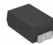
CDZT2RA4.3B Rohm Semiconductor DIODE ZENER 4.3V 100MW VMN2