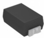
CDZT2RA5.6B Rohm Semiconductor DIODE ZENER 5.6V 100MW VMN2