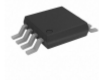
AD7476AYRMZ-REEL7 ADI (Analog Devices, Inc.) IC ADC 12BIT 1MSPS LP 8MSOP