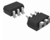
AD7476AYKSZ-500RL7 ADI (Analog Devices, Inc.) IC ADC 12BIT 1MSPS SC70-6