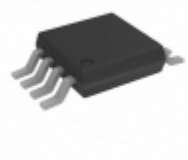
AD7476AWYRMZ-RL7 ADI (Analog Devices, Inc.) IC ADC 12BIT 1MSPS LP 8-MSOP