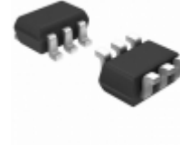
AD7476AYKSZ-REEL7 ADI (Analog Devices, Inc.) IC ADC 12BIT 1MSPS SC70-6