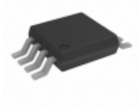
AD7476AWYRMZ ADI (Analog Devices, Inc.) IC ADC 12BIT 1MSPS LP 8-MSOP