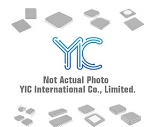
AD848AR AD AD SOP-8