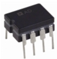
AD848AQ ADI (Analog Devices, Inc.) IC OPAMP GP 175MHZ 8CDIP