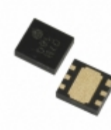
XC6123C639ER-G Torex Semiconductor Ltd. IC WATCHDOG TIMER 6-USP