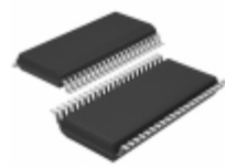
LTC2704IGW-14#TRPBF Linear Technology IC DAC 14BIT QUAD VOUT 44-SSOP