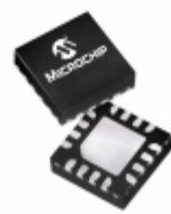
PIC16F1454T-I/JQ Micrel / Microchip Technology IC MCU 8BIT 14KB FLASH 16UQFN