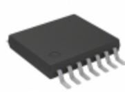
PIC16F1454-I/ST Micrel / Microchip Technology IC MCU 8BIT 14KB FLASH 14TSSOP