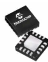
PIC16F1454-I/JQ Micrel / Microchip Technology IC MCU 8BIT 14KB FLASH 16UQFN