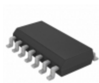
PIC16F1454T-I/SL Micrel / Microchip Technology IC MCU 8BIT 14KB FLASH 14SOIC