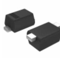
PMEG2005EB,115 Nexperia USA Inc. DIODE SCHOTTKY 20V 500MA SOD523