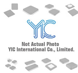
PMEG2005EB/DG NXP PMEG2005EB/DG NXP