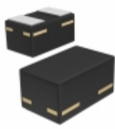
PMEG2005BELD,315 Nexperia USA Inc. DIODE SCHOTTKY 20V 500MA SOD882