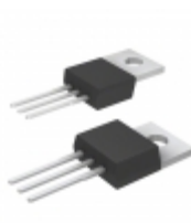
DGSK8-025A IXYS DIODE ARRAY SCHOTTKY 250V TO220