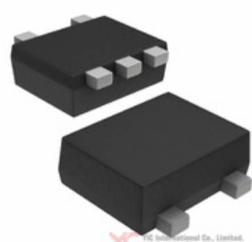
Image may be representation. See specs for product details.