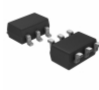
DMC205010R Panasonic Electronic Components TRANS 2NPN 50V 0.1A MINI6