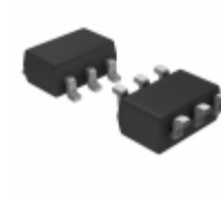
DMC204C00R Panasonic Electronic Components TRANS 2NPN 100V 0.02A MINI6