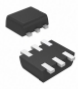
DMC2400UV-7 Diodes Incorporated MOSFET N/P-CH 20V SOT563