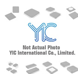
AD7818ARM-REEL7 AD AD7818ARM-REEL7 AD