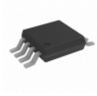
AD7818ARM ADI (Analog Devices, Inc.) SENSOR TEMPERATURE SPI 8MSOP