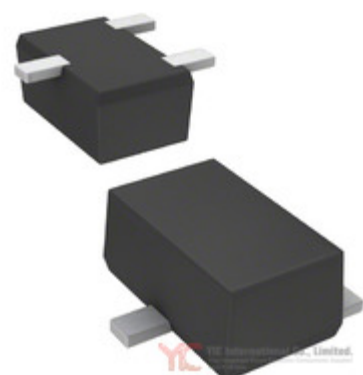
Image may be representation. See specs for product details.