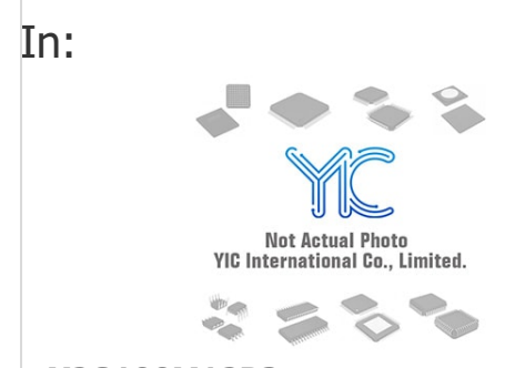
X2G100M12P3 XiPos IGBT Modules