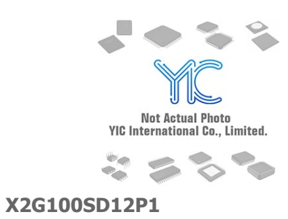
IGBT Module IGBT Modules