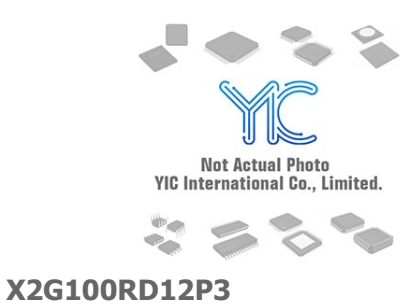
XiPos IGBT Modules