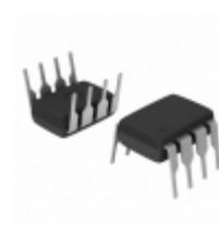
AD818ANZ ADI (Analog Devices, Inc.) IC VIDEO OPAMP 130MHZ LP 8-DIP