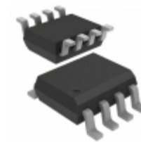
AD818ARZ ADI (Analog Devices, Inc.) IC VIDEO OPAMP LP 8-SOIC