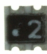
EHF-FD1552 Panasonic Electronic Components DIRECT COUPLER DUAL 800/1850MHZ