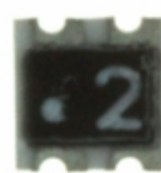
EHF-FD1546 Panasonic Electronic Components DIRECTIONAL COUPLER 800 MHZ 17DB