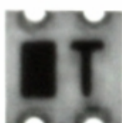
EHF-FD1542 Panasonic Electronic Components COUPLER DIRECTIONAL 1900 MHZ