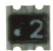
EHF-FD1550 Panasonic Electronic Components DIRECTIONAL COUPLER 1850MHZ 17DB