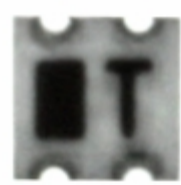
EHF-FD1548 Panasonic Electronic Components COUPLER DIRECTIONAL 1900 MHZ