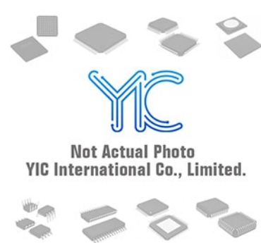
Image may be representation. See specs for product details.