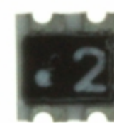
EHF-FD1549 Panasonic Electronic Components DIRECTIONAL COUPLER 800MHZ 20DB