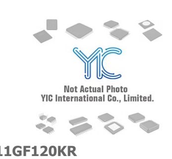
APT11GF120KR APT11GF120KR APT