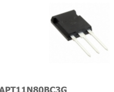
APT11N80BC3G Microsemi Corporation MOSFET N-CH 800V 11A TO-247