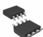
TS912BID STMicroelectronics IC OPAMP GP 1.4MHZ RRO 8SO