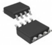
TS912AIDT STMicroelectronics IC OPAMP GP 1.4MHZ RRO 8SO