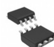
TS912ID STMicroelectronics IC OPAMP GP 1.4MHZ RRO 8SO