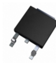
DSEP6-06AS IXYS DIODE GEN PURP 600V 6A TO252AA