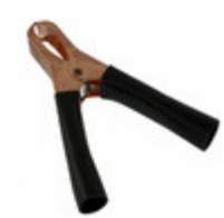
BC6TBC TPI (Test Products International) PLUNGER CLAMP CLIP BLACK 75A