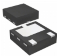
BC68PASX Nexperia USA Inc. IC TRANS NPN 2A 20V SOT1061