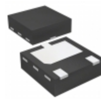
BC69PASX Nexperia USA Inc. IC TRANS PNP 2A 20V SOT1061