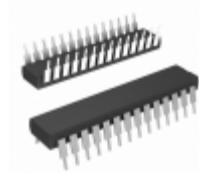
PIC18F25J11-I/SP Micrel / Microchip Technology IC MCU 8BIT 32KB FLASH 28SDIP