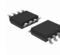
SY10EP08VZI Micrel / Microchip Technology IC GATE XOR/XNOR 3.3V/5V 8-SOIC