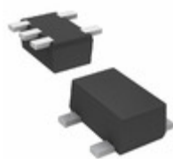
DMG563020R Panasonic Electronic Components TRANS PREBIAS NPN/PNP SMINI5