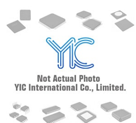
MAZS200GHL+ Panason MAZS200GHL+ Panason