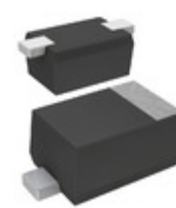
MAZS220GML Panasonic Electronic Components DIODE ZENER 22V 150MW SSMINI2