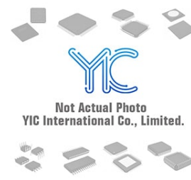
IRFP4710 IR IRFP4710 IR