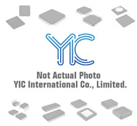
IRFP4868 IR IR TO-247