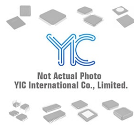
IRFP4768 IR IRFP4768 IR