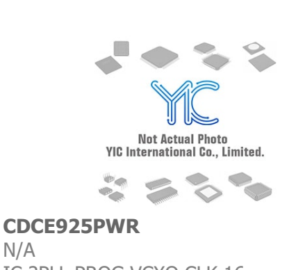
N/A IC 2PLL PROG VCXO CLK 16-TSSOP