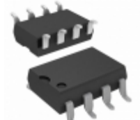
HCPL-4534-300E Avago Technologies (Broadcom Limited) OPTOISO 3.75KV 2CH TRANS 8SMD