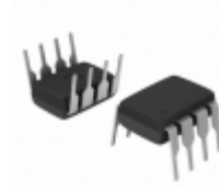
HCPL-4562#020 Avago Technologies (Broadcom Limited) OPTOISO 5KV TRANS W/BASE 8DIP