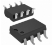
HCPL-4562#300 Avago Technologies (Broadcom Limited) OPTOISO 3.75KV TRANS W/BASE 8SMD