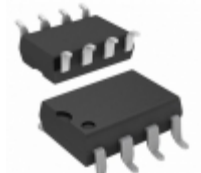
HCPL-4534-500E Avago Technologies (Broadcom Limited) OPTOISO 3.75KV 2CH TRANS 8SMD