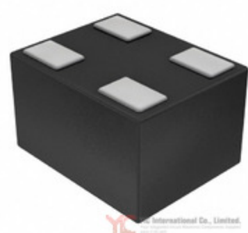
Image may be representation. See specs for product details.