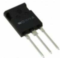
DSEP30-12CR IXYS DIODE GEN 1.2KV 30A ISOPLUS247