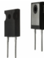
DSEP30-12A IXYS DIODE GEN PURP 1.2KV 30A TO247AD