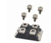
DSEP2X101-04A IXYS DIODE MODULE 400V 100A SOT227B