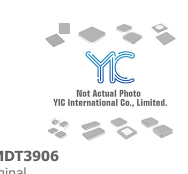
MMDT3906 Original MMDT3906 Original