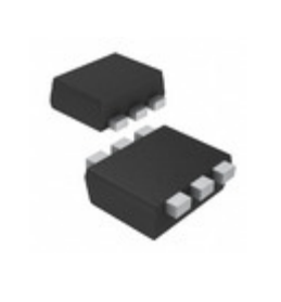
MMDT3904V-TP Micro Commercial Co TRANS 2NPN 40V 0.2A SOT563