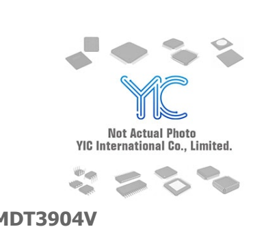
MMDT3904V Original MMDT3904V Original