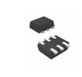
MMDT3904V-7 Diodes Incorporated TRANS 2NPN 40V 0.2A SOT563