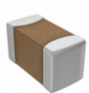
GRM188R70J223KA01D Murata Electronics CAP CER 0.022UF 6.3V X7R 0603