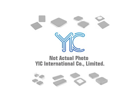
TDA12001H/N1F7F PHI QFP-128