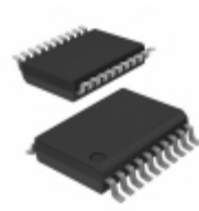
PIC18F1320T-I/SS Micrel / Microchip Technology IC MCU 8BIT 8KB FLASH 20SSOP