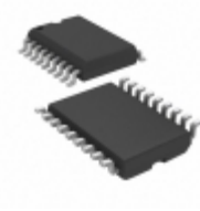
PIC18F1320T-I/SO Micrel / Microchip Technology IC MCU 8BIT 8KB FLASH 18SOIC