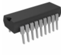
PIC18F1320-I/P Micrel / Microchip Technology IC MCU 8BIT 8KB FLASH 18DIP