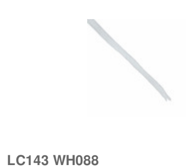
Alpha Wire LACING TAPE NYL VIN/RES WHT 500'