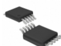
LTC1861LCMS#TRPBF Linear Technology IC ADC 2CH 12B 3V 150KSPS 10MSOP