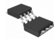
LTC1861IS8#TRPBF Linear Technology IC A/D CONV 2CH 12BIT 8-SOIC