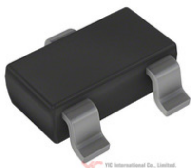
Image may be representation. See specs for product details.