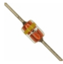
MTZJT-724.3C Rohm Semiconductor DIODE ZENER 4.3V 500MW DO34