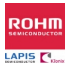
MTZJT-725.6B/5.6V ROHM MTZJT-725.6B/5.6V ROHM