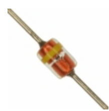
MTZJT-726.2A Rohm Semiconductor DIODE ZENER 6.2V 500MW DO34