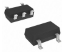
DMA202010R Panasonic Electronic Components TRANS 2PNP 50V 0.1A MINI5