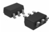
DMA206010R Panasonic Electronic Components TRANS 2PNP 50V 0.1A MINI6