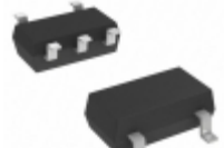
DMA201010R Panasonic Electronic Components TRANS 2PNP 50V 0.1A MINI5