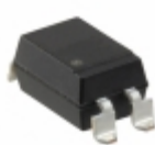
PS2502L-1-E3-A CEL OPTOISOLATOR 5KV DARL 4SMD