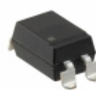
PS2502L-1-A CEL OPTOISOLATOR 5KV DARL 4SMD