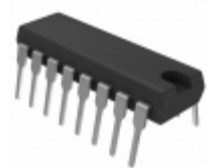
PS2502-4X Isocom Components 2004 LTD OPTOISO 5.3KV 2CH DARL 16DIP