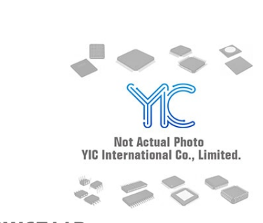
SPW6711B SUNPLUS SUNPLUS QFN