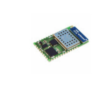
SPWF04SC STMicroelectronics WIFI MODULE WITH U.FL. CONNECTOR