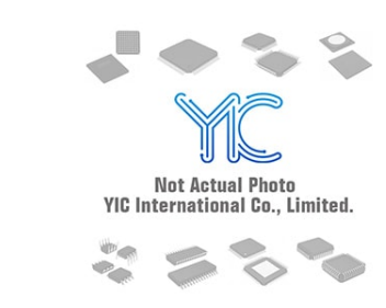
SPW6711B-EV161 SUNPLUS SUNPLUS TQFN40