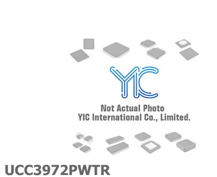
IC CCFL DRIVER CONTROLLER 8TSSOP