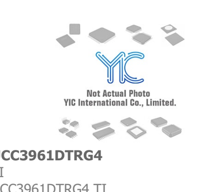
UCC3961DTRG4 UCC3961DTRG4 TI