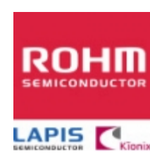
MTZJT-725.6B/5.6V ROHM MTZJT-725.6B/5.6V ROHM