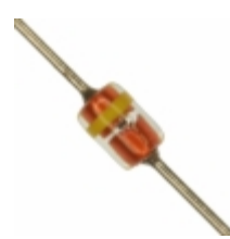
MTZJT-7239C Rohm Semiconductor DIODE ZENER 39V 500MW DO34