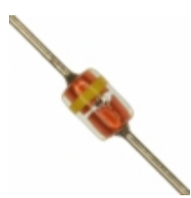
MTZJT-725.6B Rohm Semiconductor DIODE ZENER 5.6V 500MW DO34