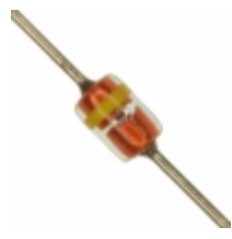
MTZJT-724.3C Rohm Semiconductor DIODE ZENER 4.3V 500MW DO34