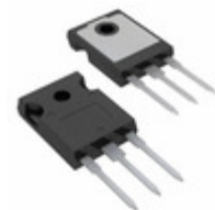
IRFP4668PBF Infineon Technologies MOSFET N-CH 200V 130A TO-247AC